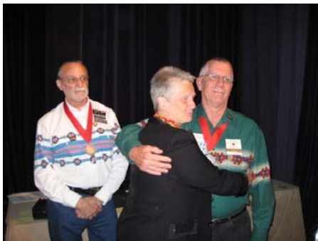
July 5, 2008

For Your Extraordinary Dedication and Support of GLBT Square Dancing