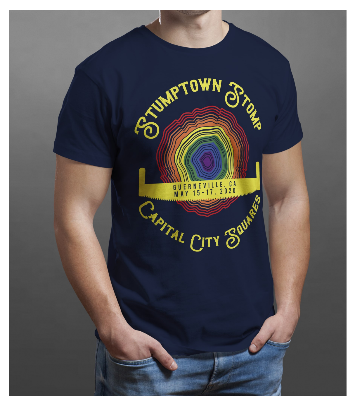
PRE-ORDER NOW TO MAKE SURE YOU GET ONE

ONLY $18 (Sizes S, M, L, XL) and $21 (Sizes 2XL, 3XL)